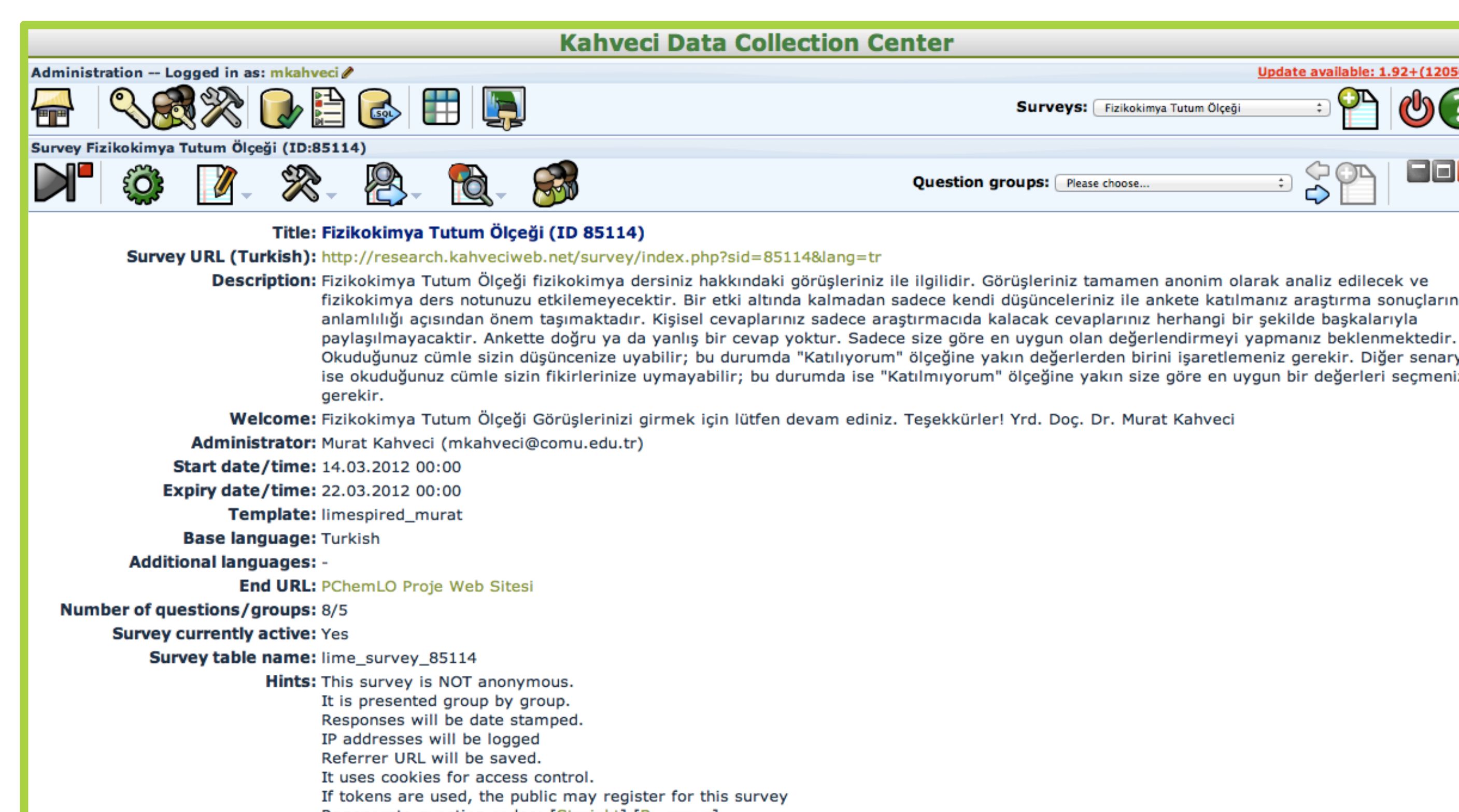
Figure 3. Lime Survey data collection management interface.